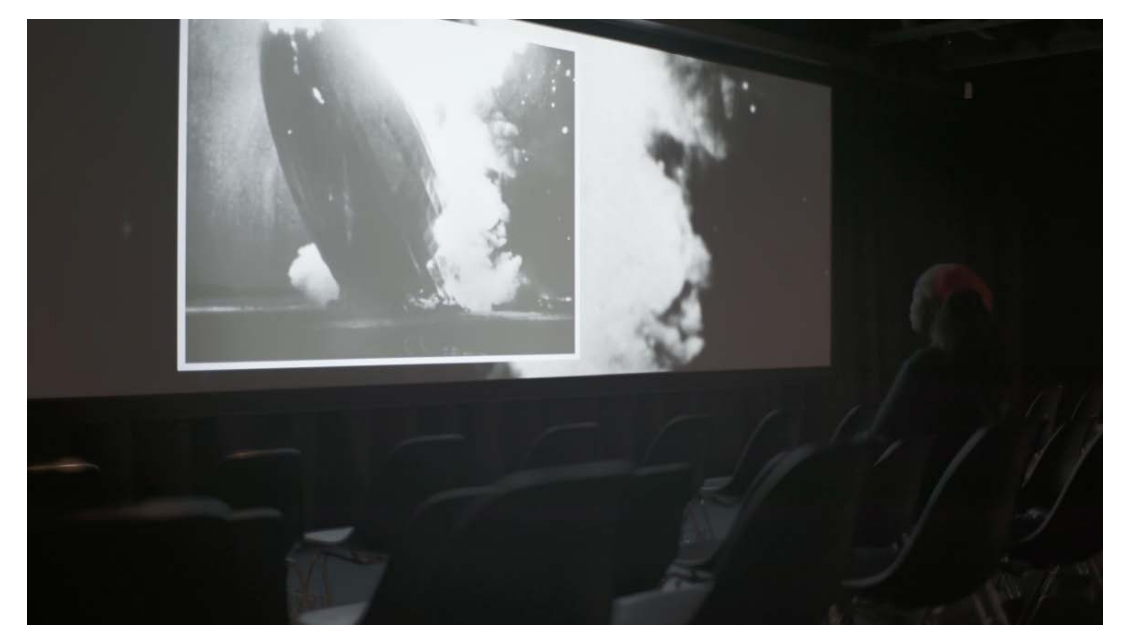
Filmstill Image and Power: Christelle Oyiri